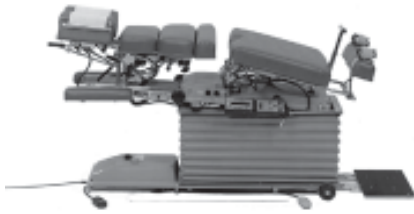
Shown With Optional Drops