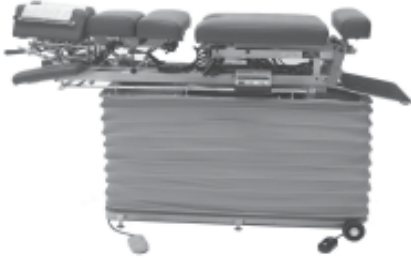
Shown With Optional Drops