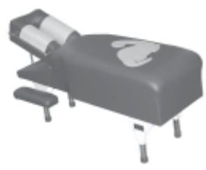
203ABNAHC * w/ Optional Dinosaur Logo