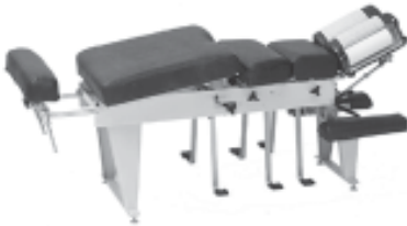
Shown With Optional Drops