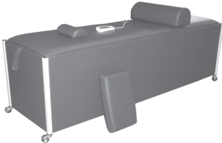
Optional 25" Wide Table..... 125.00