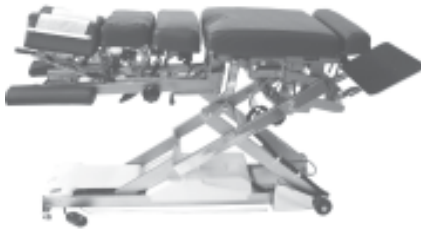
Shown With Optional Drops