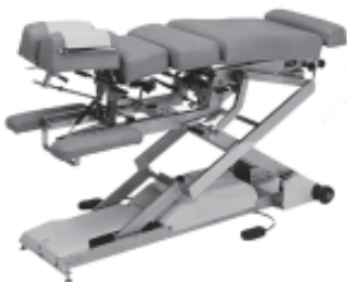
Shown With Optional Drops