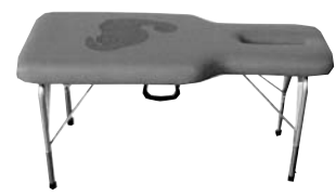
C106 Child's Portable Table *Shown with optional Dinosaur Logo