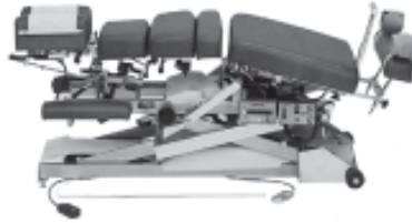
Shown With Optional Drops